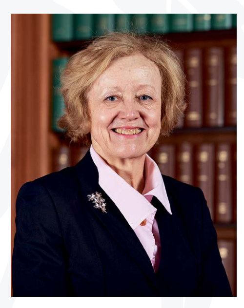
Justice of The Supreme Court, The Right Hon Lady Arden of Heswall DBE

"We hope that readers and participants in the meeting at the Supreme Court will find this selection of cases informative. We particularly value dialogue with judges from different jurisdictions."