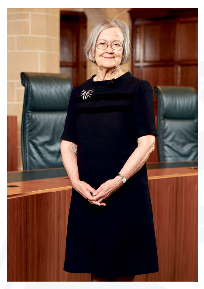
BRENDA HALE President, Supreme Court of the United Kingdom

President of The Supreme Court, The Right Hon the Baroness Hale of Richmond DBE