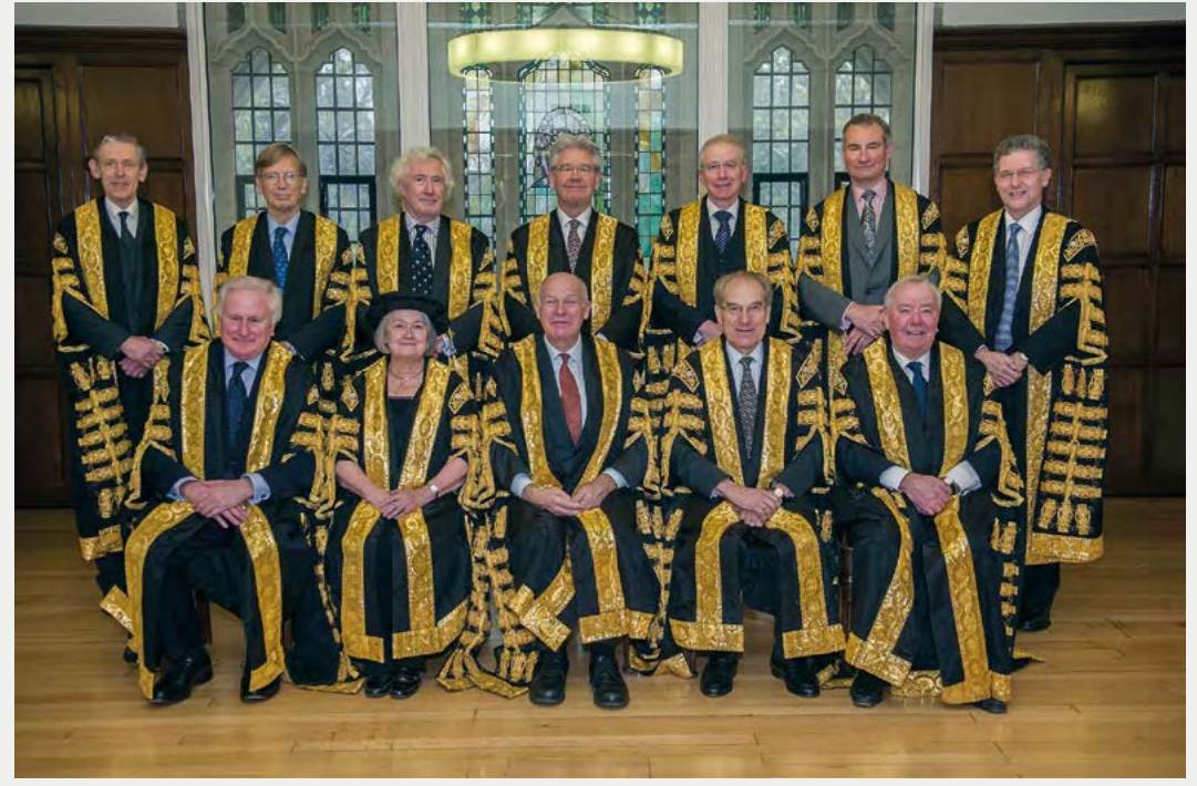
Left: The Justices of the Supreme Court pictured in December 2013